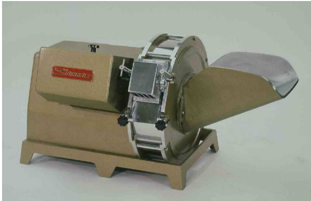
French fries slicing machine KF with circular slicing block